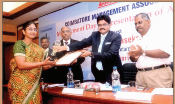
Best Faculty Award