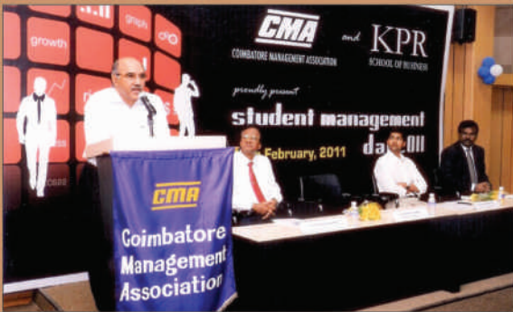
Student Management Day