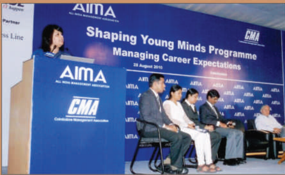
Shaping Young Minds Programme