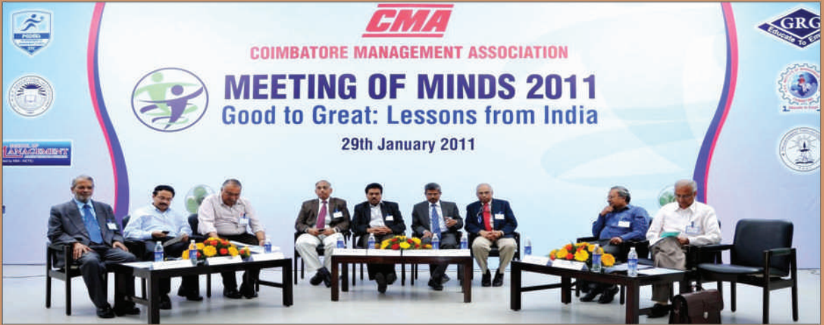
Meeting of Minds 2011