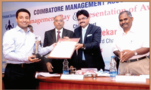
Best Entrepreneur Award