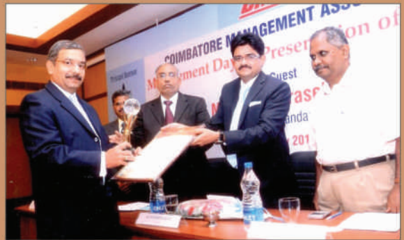
Best Manager Award