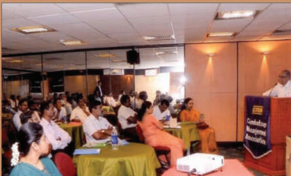
Workshop on Managerial Excellence